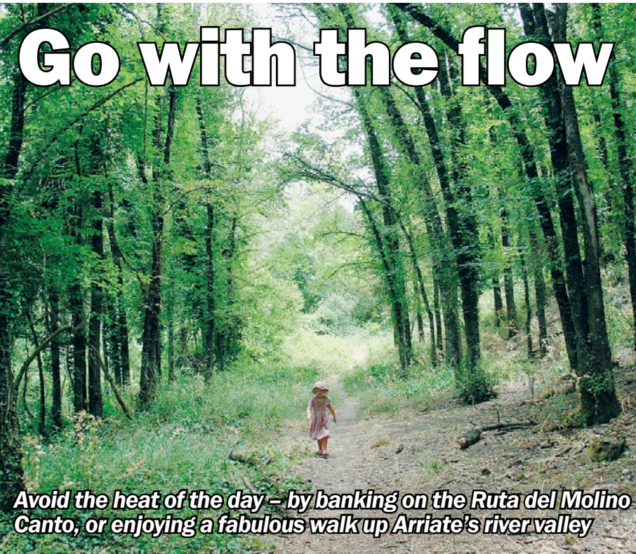
Avoid the heat of the day – by banking on the Ruta del Molino Canto, or enjoying a fabulous walk up Arriate's river valley

n DISTANCE: 2 to 10 kms n TIME REQUIRED: 1 to 3 hours n RATING: Easy