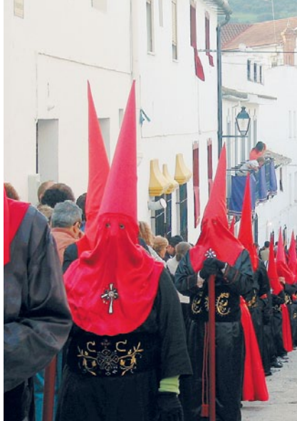
TRADITION: The highly anticipated processions during Semana Santa are a highlight