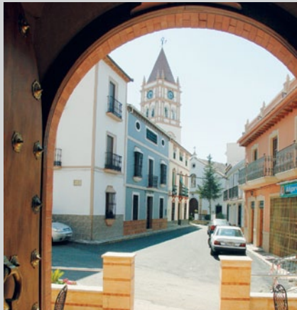
ARRIADH: First mentioned in 1407