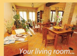
Your living room...