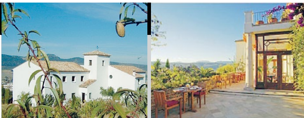
VISTAS: From Arriadh (left) and Fuente (right)