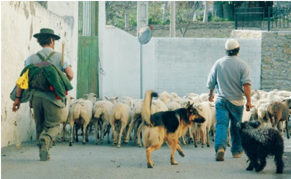
TRADITION: Shepherds head into the nearby hills Much of this conveniently links back to the village's origins, when it formed to supply food to the key Arabic settlement of Ronda. There is certainly no shortage of good farmland still being used in the area and one concrete link back to the village's ancient past is a working acequia (or water

respect the environment, not so much for our generation, but for later generations," he added.