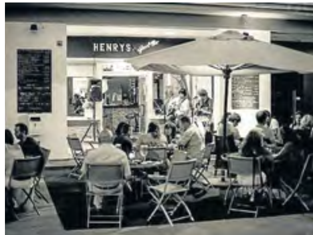
HENRY'S: It has a friendly, laid-back atmosphere