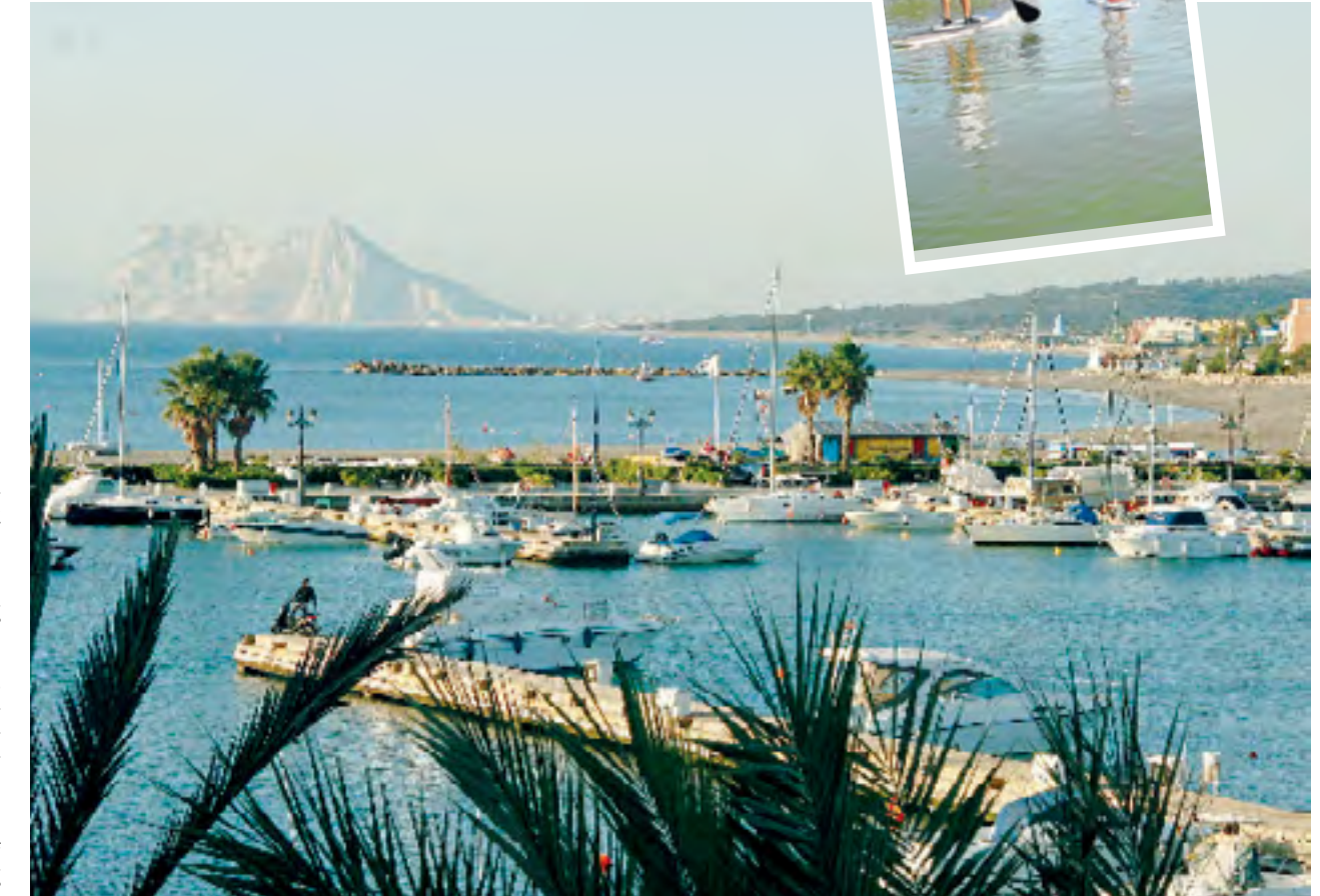
PRIVILEGE: Sotogrande marina is a wonderful spot for a stroll or lunch, while (top) paddle surfing in Guadiaro

"Polo is a drug only curable by poverty or death." (From Polo by Jilly Cooper)