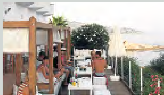
style on the place.

After setting up two dozen businesses in the area he has settled on being a hotelier and has very much stamped his