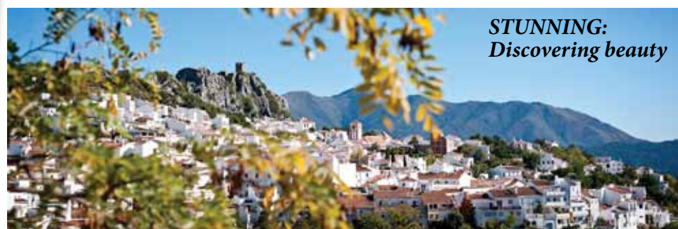
STUNNING: Discovering beauty