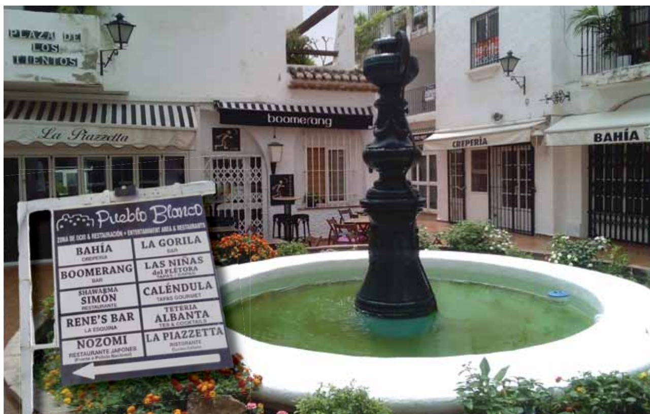
FOUNTAIN OF FUN: Hip to be square in Pueblo Blanco