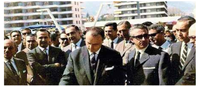
CUTTING THE RIBBON: Opening a new era

Born out of Spanish oppression, the gay heart of Torremolinos still thrives more than half a century on