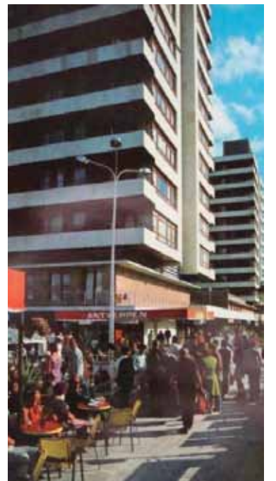
BOOMING: In the 70's