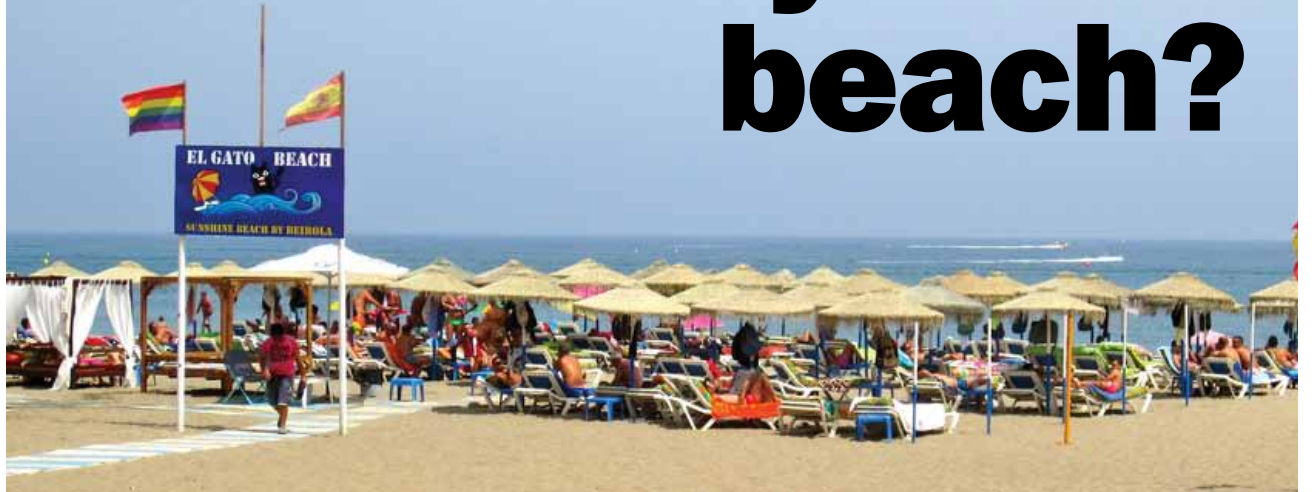
EL GATO BEACH: The place to be seen

There really is something for everyone in gay-friendly Torremolinos. Grab a cocktail and your sunnies to read the Olive Press' guide to the 'hottest' places to hang out this summer