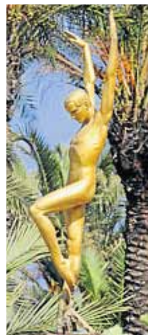
GOLDEN TIMES: Street performer (above) and drag queen (below)

But, in Andalucía, the economic benefits outweighed Franco's personal animosity towards this sector of