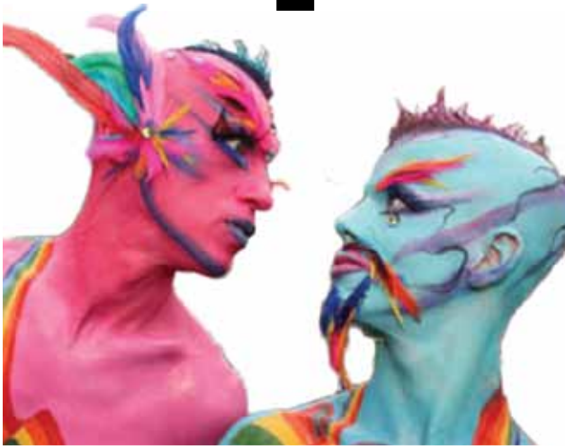
VIBRANT: Colours of pride

A decade since gay marriage was passed in Spain, Torremolinos is gearing up for its first official Pride celebration