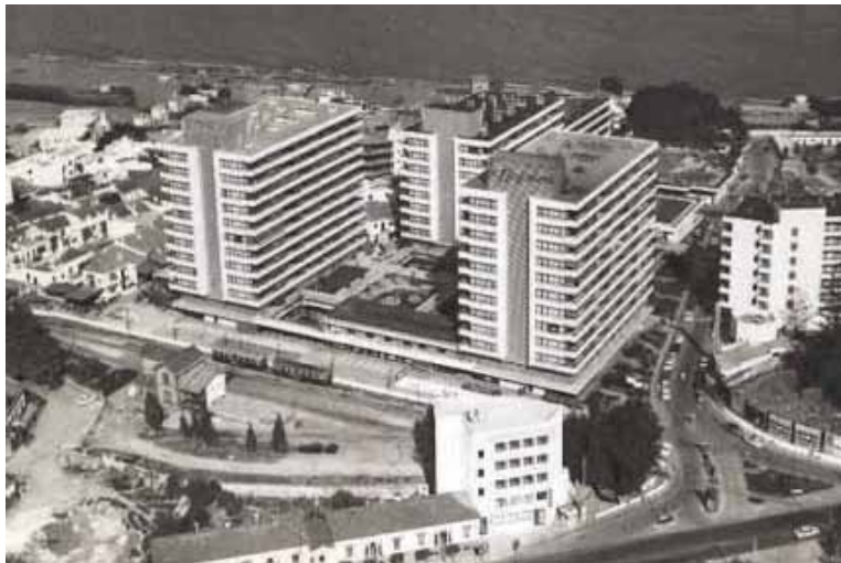
FRESHLY BUILT: La Nogalera circa 1960's

And, judging by the many tales told over foaming pints of ale in this nutty district, their story looks set to run and run.