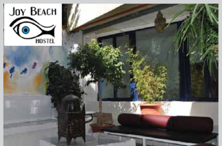
JOY BEACH: Terrace escape

Winners will be announced in the Olive Press, online at www.theolivepress.es and the Facebook Group. Good luck and be happy!