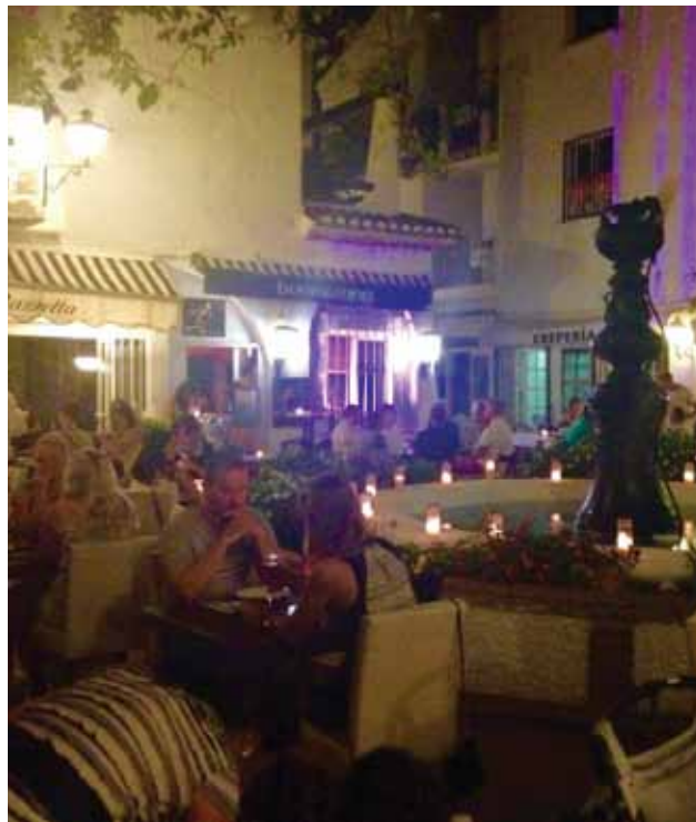
AT NIGHT: Pueblo Blanco offers a night to remember

But Pueblo Blanco has had to fight hard to shake off its notorious past and claims that it was built out of money from a kidnapping, writes Chris Birkett