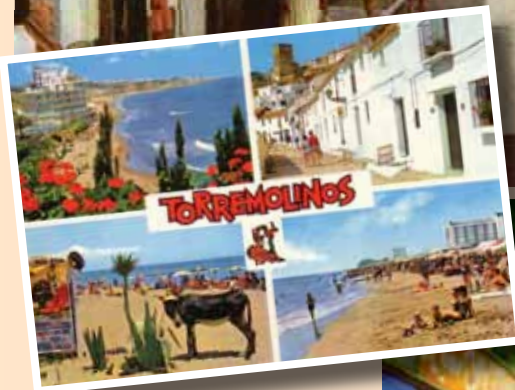
A COLOURFUL PAST: Torremolinos' many sides