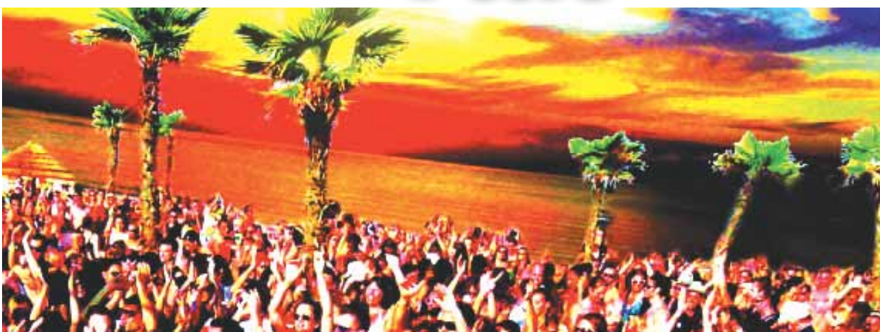
ON THE BEACHES: Rainbow sunset over a typical Pride event in Torremolinos

LGBT-ers from around the world are flocking to splurge a rainbow of currencies in Spain's gay capital