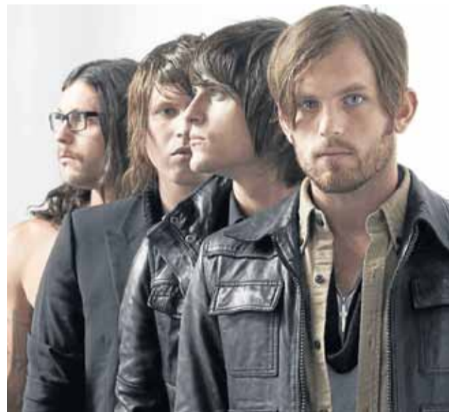
ROCK KINGS: Kings of Leon stars to headline

vestigative reports, special features, plus regular articles on food and dining, business, motoring, education, golf and much more besides, guaranteeing its popularity with the most discerning of readers. It will be a newspaper which looks beyond the press releases and asks the difficult questions other publications turn a blind eye to. And it is not a shot in the dark. The Gibraltar Olive Press is being launched by Luke Stewart Media SL, publishers of southern Spain's most popular English-language newspaper which has been published since 2006. It is recognised as the leading investigative newspaper covering Andalusia with a widespread cosmopolitan readership. Exciting times lie ahead for the Olive Press and for our participation on the Rock. In the words of Fabian Picardo himself, 'Times they are a-changing'... and they are changing for the best!