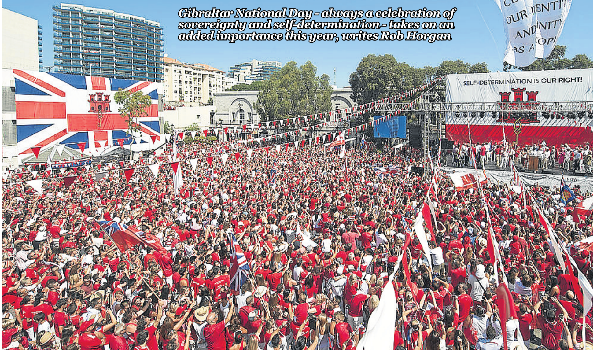
ROCK ON: Casemates Square is set to be awash with a sea of red and white on National Day, next Thursday