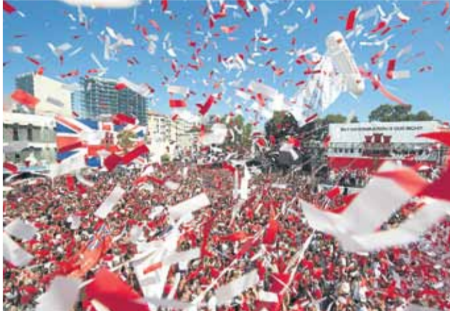
PLACE TO BE: Party time in Casemates Square and (right) party goes in red and white