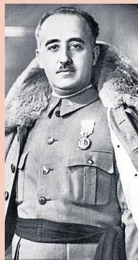
CLOSED DOWN: Franco shut border in 1969

"I'm performing in the morning just such a special day because everyone is so happy. We're a big family."