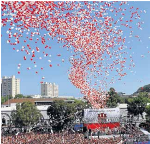
SPECTACULAR: The balloon release

they can take years to decay and in the meantime litter cities, fields and the sea. However, the anti-balloonists seem to be in the minority, as the balloons inspire feelings of pride and solidarity across the Gibraltar community.