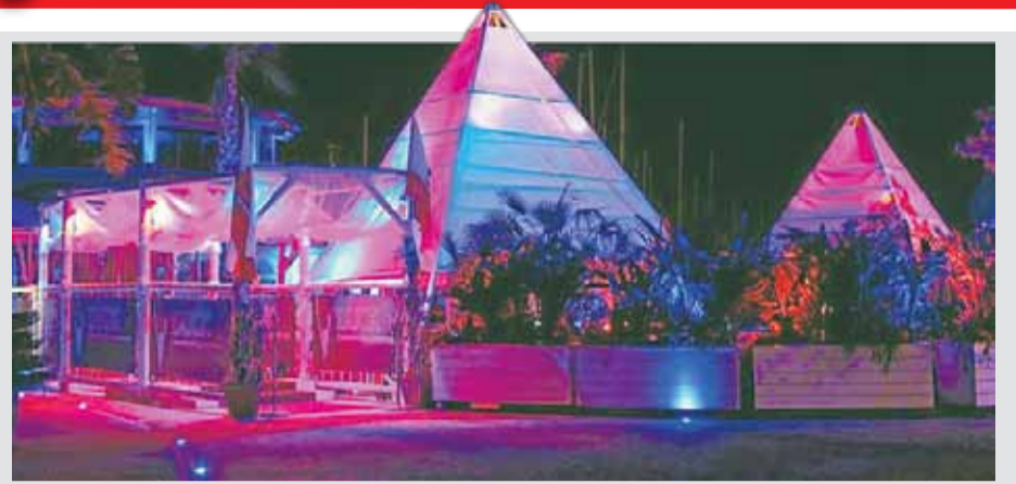
PARTY TIME: All night long at Dusk nightclub in Gibraltar