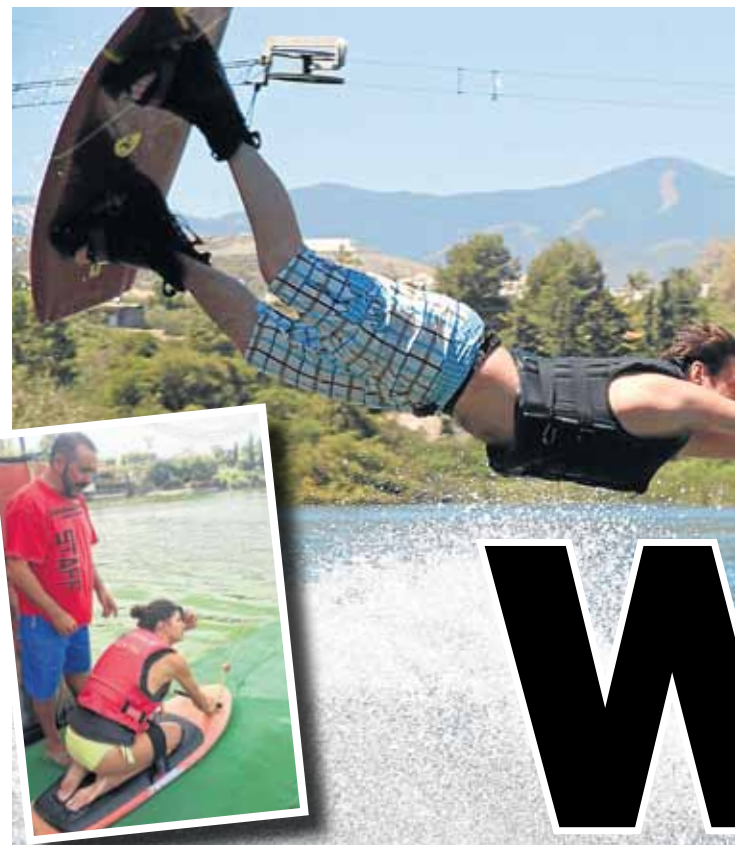
FLUNG INTO ACTION: At the Wakeboard Centre and (top right)

Too late! The pulley whips its way towards me, the cable tenses and San Pedro prepares for the most artless