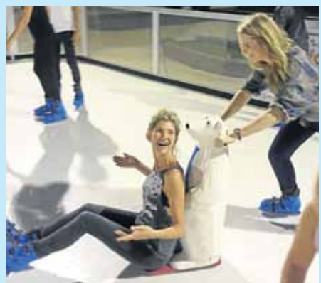
FUN AND GAMES: On the rink