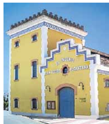
SWEET: The old sugar mill