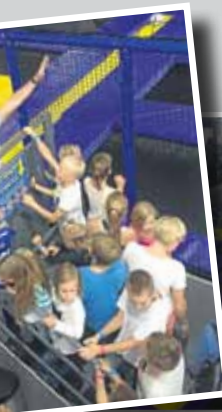
BOUNCE TIME: At CostaJump